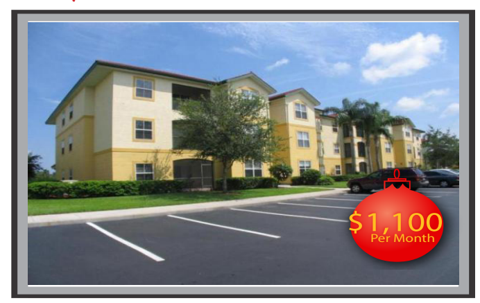
Take a video tour of our available properties at www.thechanggroup.com under the "For Rent" tab.